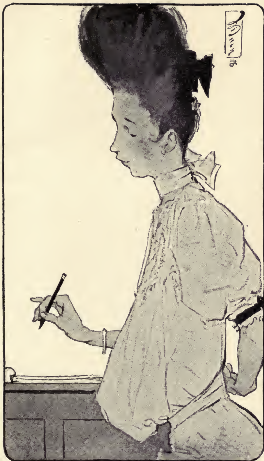
“ Her pencil was delicately poised above the ruled page ”